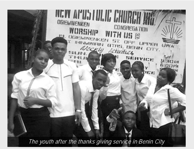
Though this thanksgiving service message was about reconciliation, the members were encouraged that it pleases God to repent, forgive and reconcile before giving a gift