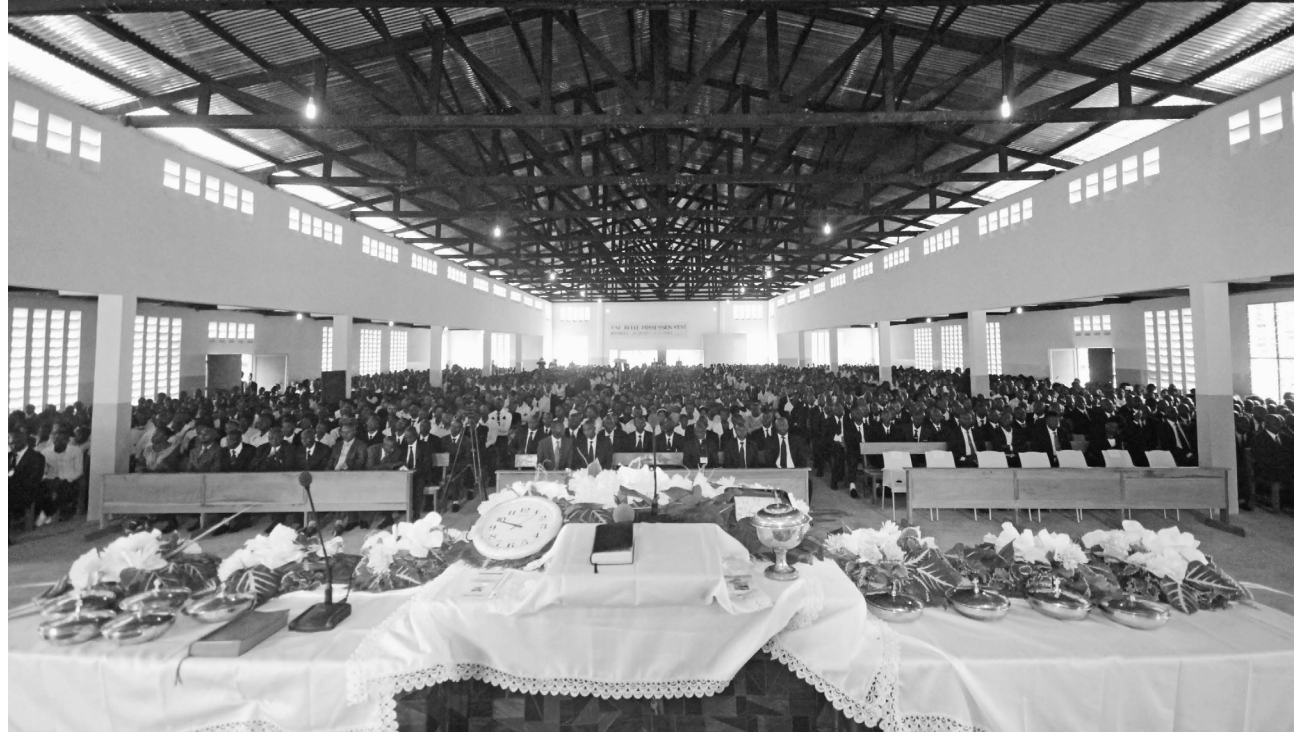
Inside the new church. A total of 19,000 people have gathered in and around the building

Although the Church owns a piece of property in the city centre, there just was not enough money for a new church building. Together with the members, the Church leaders decided to deconstruct the old building and move the building material to the new site to erect a new church with it there.