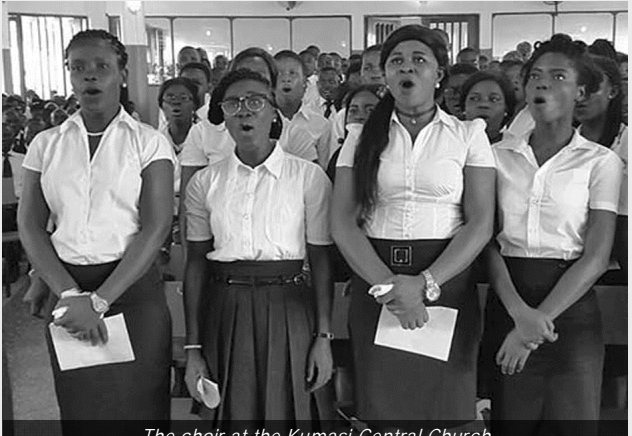
The choir at the Kumasi Central Church

At the divine service on Wednesday, January 18, 2017 in Accra, the District Apostle retired a District Evangelist from Volta South. A new District Elder was ordained for the continuation of the pastoral work. Approximately 1,500 participants were recorded.