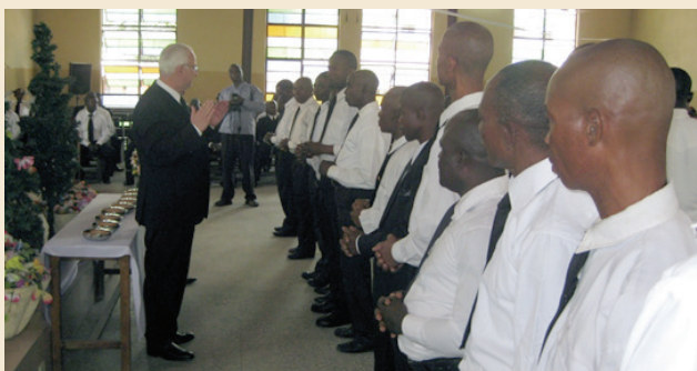
Addressing the ministers before ordination