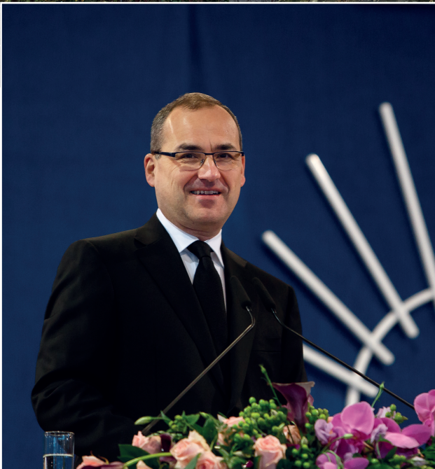
Divine service in Luxembourg on 11 January 2015