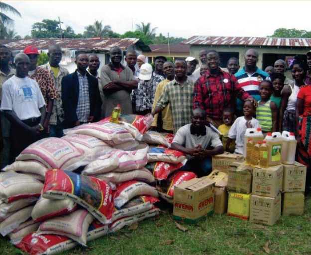
Quarantined Community of Smell-No-Taste