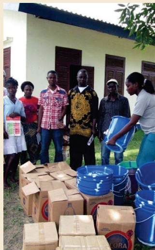
Ebola Prevention Materials for Congregation in Margibi County

'non-essential' civil servants were asked to stay home, and many communities were quarantined. Meanwhile, hospitals, clinics and other health centers were closed down. Health practitioners such as doctors and nurses were also being infected by the virus. Some died and worsened the health crisis in the country.