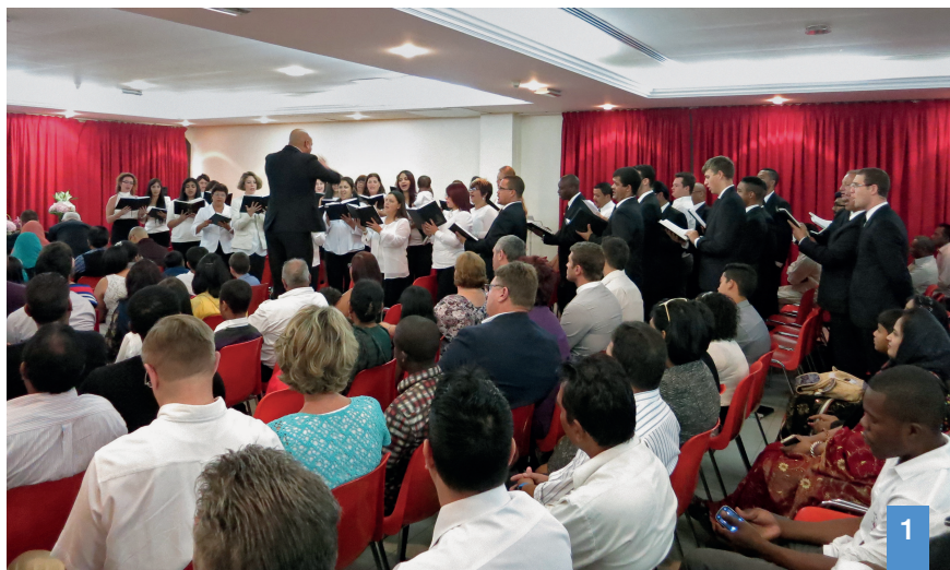
1, 2, 4, 5: NAC Southern, Germany. 3: Christ Church Jebel Ali