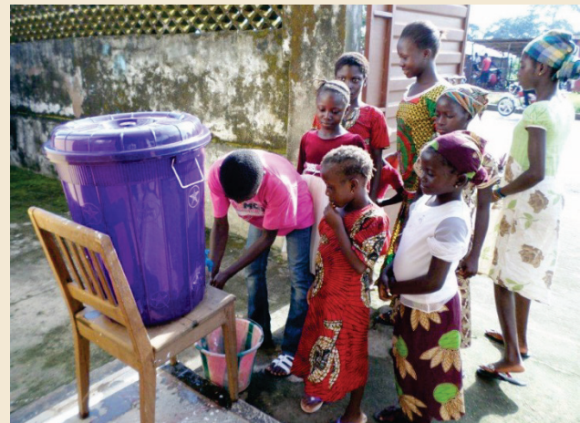
Sunday school children washing their hand before entering into Makeni Central Church