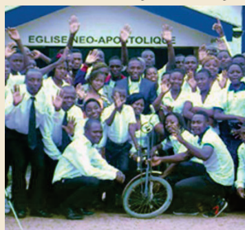
Happy young members after Divine service.

Truly "The Youths are Tomorrow's Leaders" and the youths of the Eglise Néo-Apostolique in Cameroon also realise how important they are in the development church that's why they took as Theme for the first youth movement "Dynamic youths, key to Church Development". From the 7-9 August 2014, the Youths from some parts of the Eglise Néo-apostolique gathered in Kribi to discuss the roles they can play in Church development. During these days they engaged in evangelical activities, talks and sketches on how to read and use the Bible, singing, dancing, and a whole lot on church Ministry. They were guided during these days' activities by District Ministers and the Apostle for the French speaking part of Cameroun. The youths felt very important as they were listened to, thought how to be a better youth, how to put their youthful energy, efforts in action, understanding that making mistakes