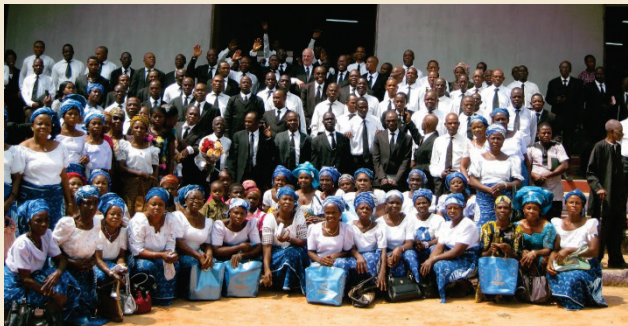
Part of the congregation after the divine service in Owerri