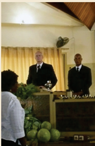
District Apostle at the altar