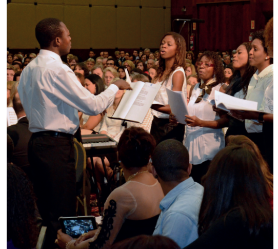
Left and above: The choir and orchestra contributed to the divine service with their music

federal state of São Paulo, as well as from some of the neighbouring states, were invited to the Sunday divine service, which took place in a local hotel.