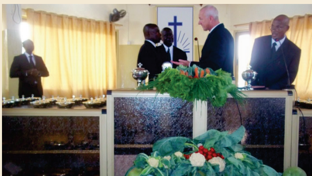
Retirement of some District Leaders