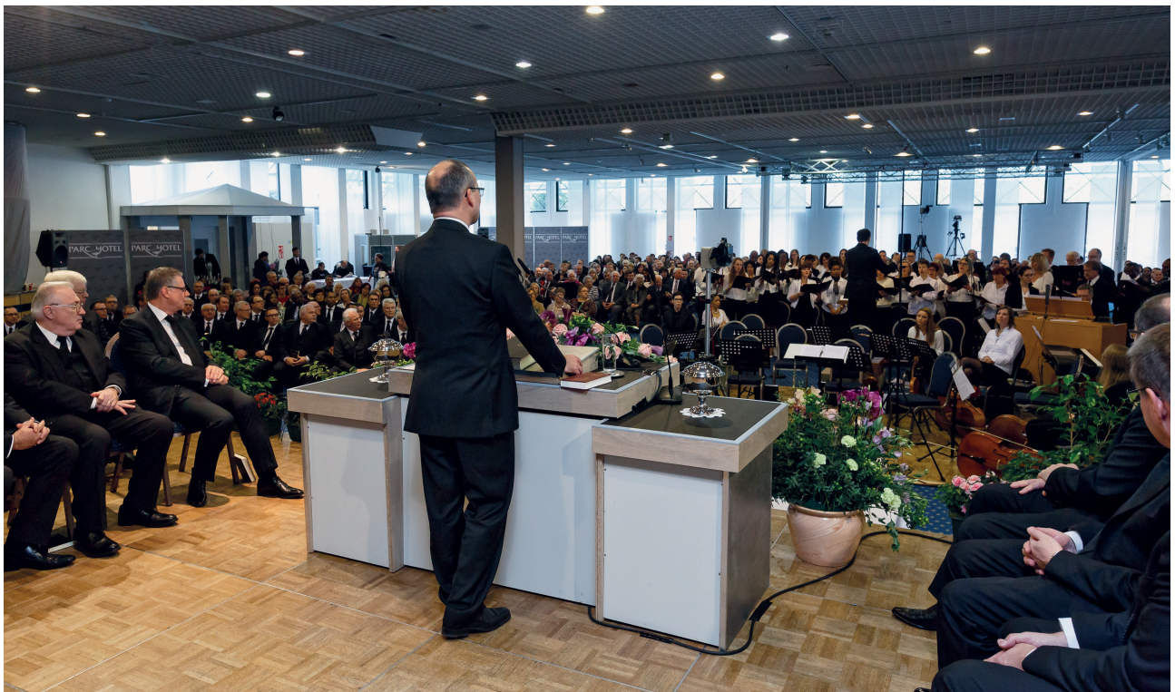
Bottom: Contribution by the choir during the service