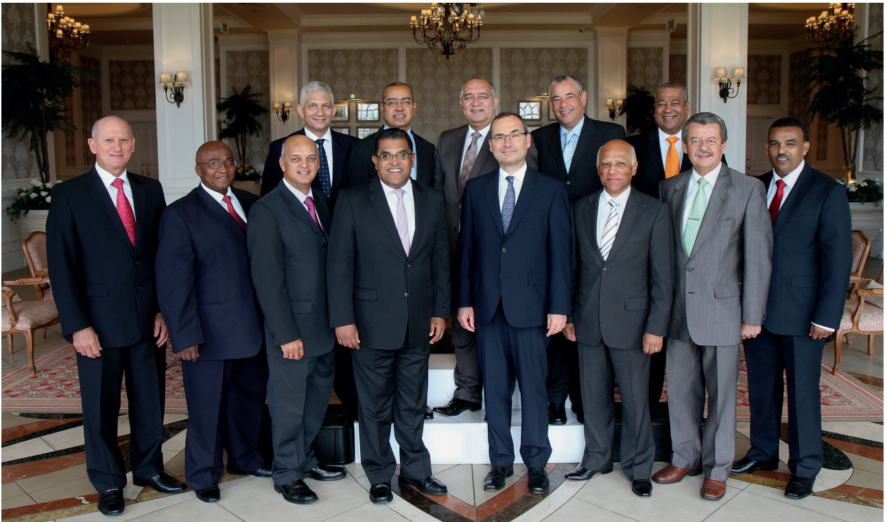
■ NAC Cape