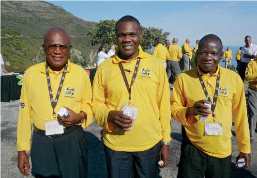
Below: Impressions from the Apostles' conference in Angola